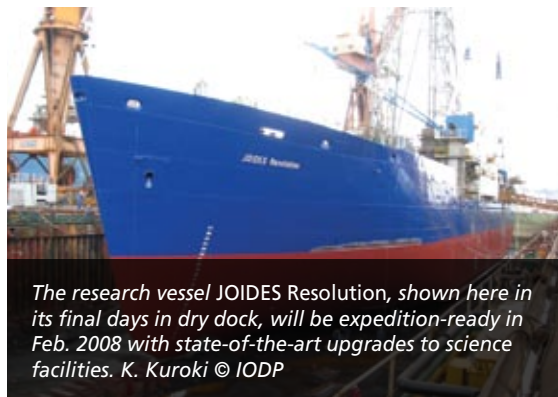
The research vessel JOIDES Resolution, shown here in its final days in dry dock, will be expedition-ready in Feb. 2008 with state-of-the-art upgrades to science facilities.

December. Following load out, science equipment testing and transit to the first port call, the ship will be expedition-ready in February.