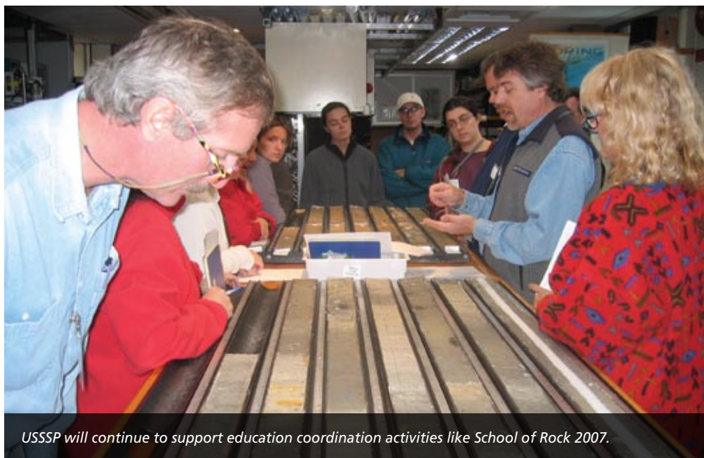
USSSP will continue to support education coordination activities like School of Rock 2007.